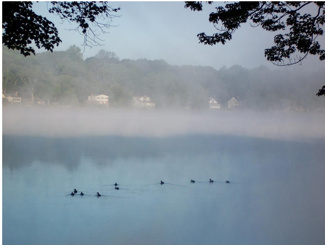
Ducks in the morning By Paul Oliver